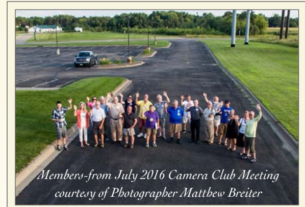
Members from July 2016 Camera Club Meeting

The Monticello Camera Club is a group of photography enthusiasts who range in skills and abilities as well as equipment used. We have a membership that uses film and digital cameras that range from point and shoot, cell phones to high quality SLR and digital SLR. Everyone is Welcome. All that is required is a desire to share in this great hobby. Please join us for our monthly Camera Club Meetings.