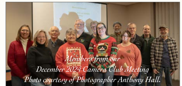
Members from our December 2024 Camera Club Meeting

Stop by and see if our club is right for you.