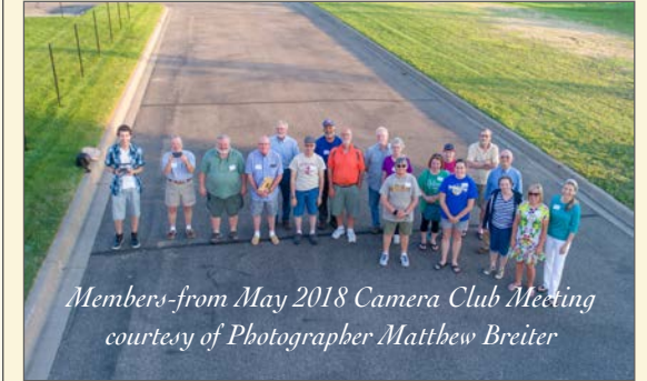
Members from May 2018 Camera Club Meeting

The Monticello Camera Club is a group of photography enthusiasts who range in skills and abilities as well as equipment used. We have a membership that uses film and digital cameras that range from point and shoot, cell phones to high quality SLR and digital SLR. Everyone is Welcome. All that is required is a desire to share in this great hobby. Please join us for our monthly Camera Club Meetings.